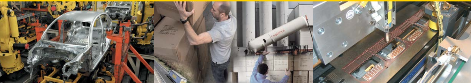
Integrated identification of all components in car assembly process

RFID systems contain three parts: the tag, transceiver, and interface. Tags can be active (requiring a battery) or passive. These tags contain internal circuitry that respond to a specific radio frequency, which is provided by the transceiver. The transceiver, which is often called a reader or antenna, is responsible for communicating with the tag. The interface is the means of communicating the data to a higher level data collection device, such as a computer or a programmable controller. RFID in the industrial environment enables customers to improve accuracy, provide faster production speeds and minimize errors, and achieve substantial cost savings from both a material and labor standpoint.